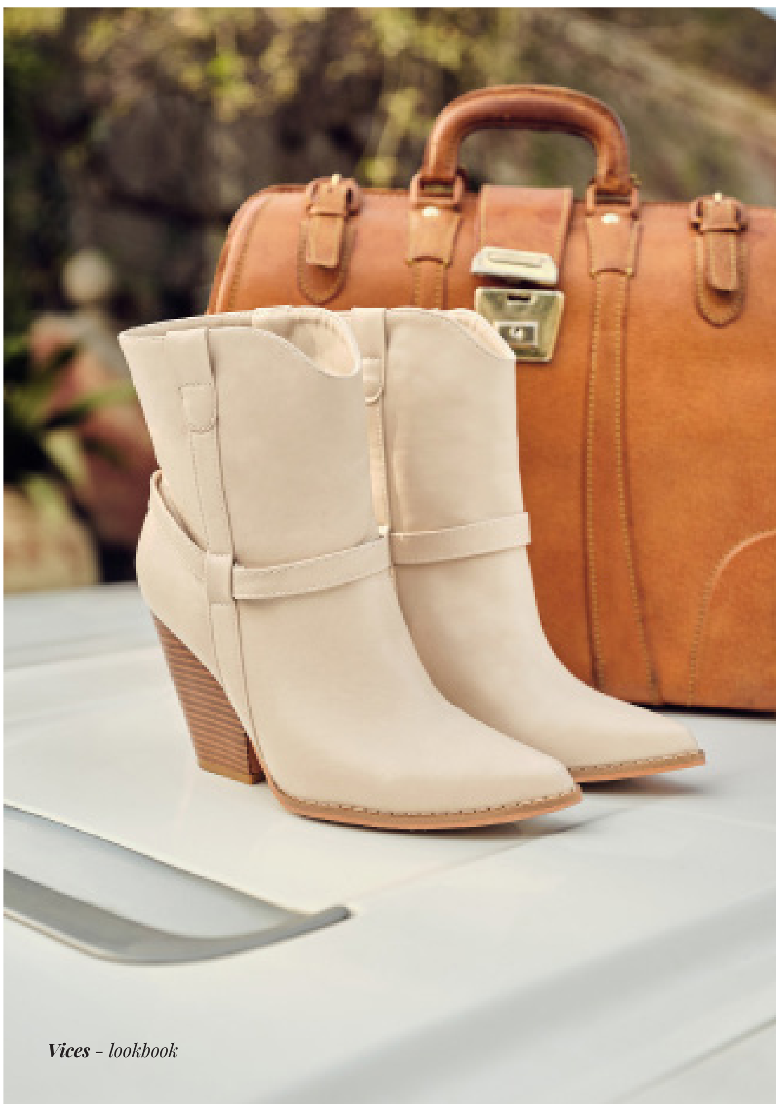
Vices - lookbook